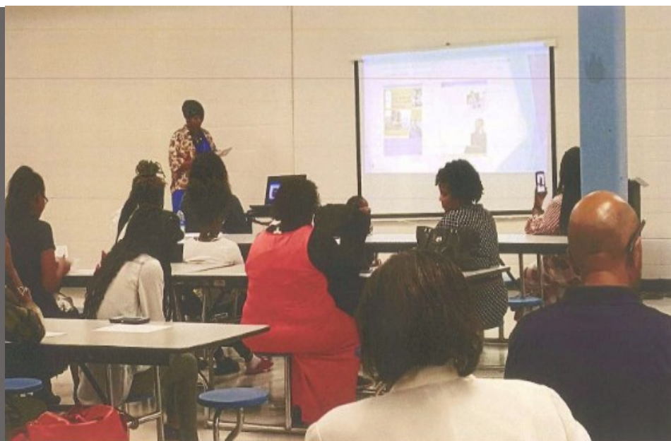
Parents receiving valuable information at a school's parent night

Additionally, the Title I department will provide training to principals during the 2018-2019 district summer leadership team summit and will post a webinar so principals will understand parent and family engagement requirements and plan opportunities for family engagement activities and meetings for the remainder of the school year.